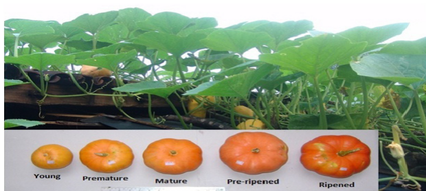
Figure 1. Cucurbita maxima fruit at its sequential stages of growth and ripening

Food and Agriculture Organization of United Nation (FAO), the world production of pumpkins, squashes, and gourds in 2011 was estimated over 24.3 million tons harvested from 1.7 million hectares (FAOSTAT, 2013). Cultivation of Cucurbita cultigens as a food source on an international scale over the world attributed to their adaptability in range of climatic conditions provide great opportunities for increased diversity and market growth by introducing underutilized forms of existing species (Rai et al. , 2008).